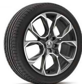
20" XTREME Alloys STANDARD ON KODIAQ RS