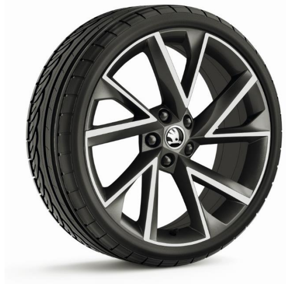
19" 'VEGA' Anthracite Alloys STANDARD ON SPORTLINE